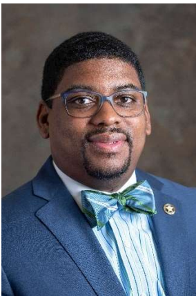
Commissioner Sheriff Lafayette Woods