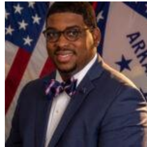
Commissioner Sheriff Lafayette Woods